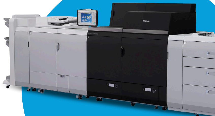
Pictured: Canon imagePRESS C10000VP

In-line finishing options: Increase productivity thanks to a comprehensive choice of automated in-line finishing capabilities and compatibility with third-party in-line finishing devices. Booklet-making, perfect binding, high-capacity stacking, multiple folding are all available. A new professional puncher supports several additional formats and offers a lot of extra options.